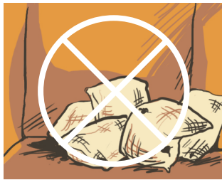
GONY MALOTO, AMIN'NY TANY