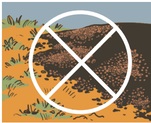
FANAHAZANA MIVANTANA AMIN'NY TANY