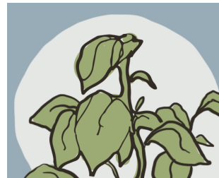
VOLY SALAMA TSARA