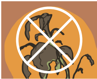
VOLY TSY SALAMA