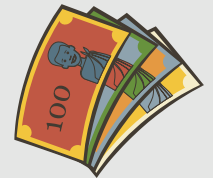
Di pah'ri arziki