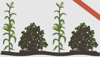
Bir'tigabri bin'dir sha a puuni