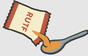
Bin'dirgu ti bihi ban ka Alaafee bin'dira