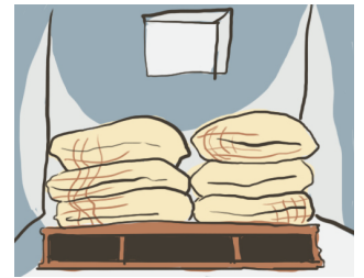
KUIKA MASAKA YOYERA PAMWAMBA PA ZITHU