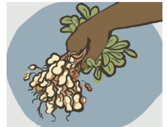
KUKOLOLA PANTHAWI YOYENERA