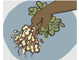
N DANG SIMA PEBU