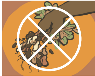
SIMA DI NI YOLI PEBU