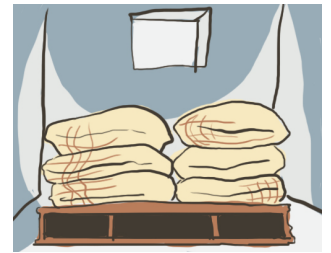
KPALAN VELA DINI BE DO TINGBAN NIELI ZUGU