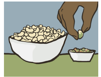
SIMA DINI NGAHAM