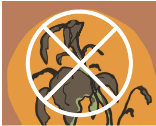
SIMILI DINI NKA ALAAFEE