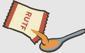
Manje pou Moun ki fè Malnitrisyon