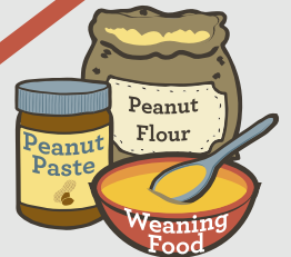
Manje ki bon pou Lasante