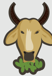
Manje pou Bèt