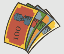
Aumento de Ingresos