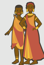
Empoderamiento de las Mujeres