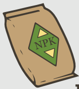
Fijación de Nitrógeno