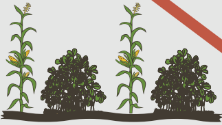
Nnɔbae a yede sisi nnɔbae foforo a yeaduadua mu