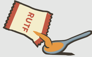
Nnuane a yede ma won a wonni nnuane pa