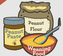
Nnuane a ema apɔmude