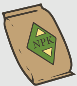
Nnuane nnuro a yede hye asase no my