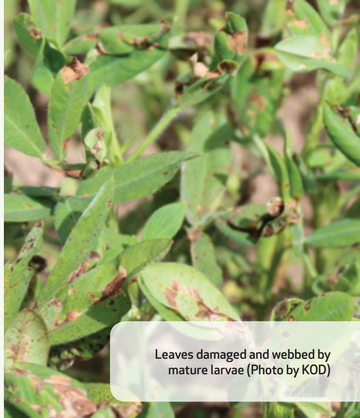
Leaves damaged and webbed by mature larvae

Adults of A. modicella are greyish moths that lay eggs singly on the underside of groundnut leaves and on petioles. Yellowish green larvae hatch, tunnel into leaves and feed between the upper and lower epidermis of leaves. Damaged leaves become brown, rolled and desiccated, resulting in defoliation. Later instars appear on the leaf surface, where they roll and web it, or they web two leaves together. Pupation takes place inside the webbed leaflets.