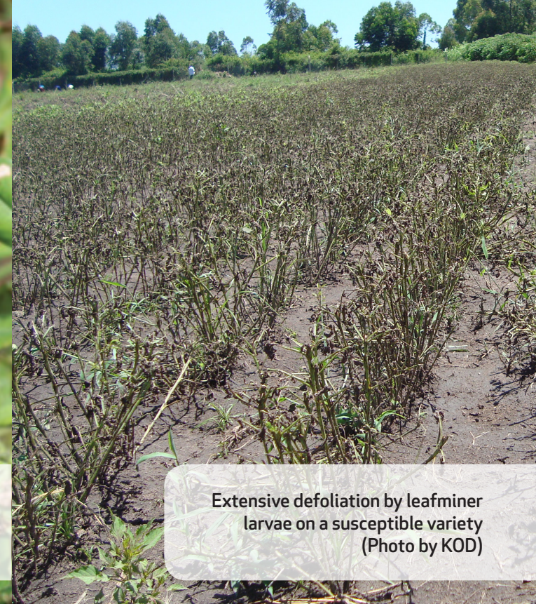
Extensive defoliation by leafminer larvae on a susceptible variety