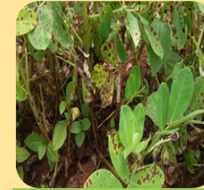
Matenda yama tepo